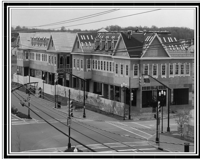
Construction of the Village Center, at the intersection of Market Street and Schalks Crossing Road.

VILLAGE CENTER – A number of things are happening simultaneously at the Village Center site that offer a glimpse of how the Village Center will look when completed. For example, the new sewers and streets are going into place and the first commercial buildings are rising out of the ground along Schalks Crossing Road. The next four commercial buildings, located along the new Market Street, are expected to be under construction sometime this spring. The residential portions of the Village Center (23 single-family and townhouses, and eight apartments) are not expected to be under construction until most of the commercial development is complete. Completion of the 16-acre Village Center development is expected to occur sometime in the next two years.