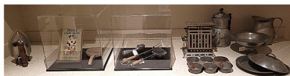
Kitchen utensils and tools used during the 19th and 20th centuries.