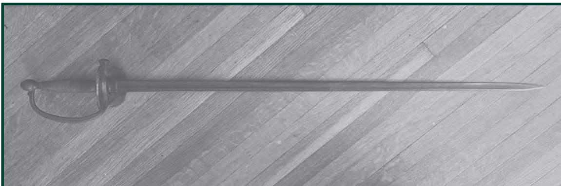
Civil War-era sword that was found in a historic home in Plainsboro