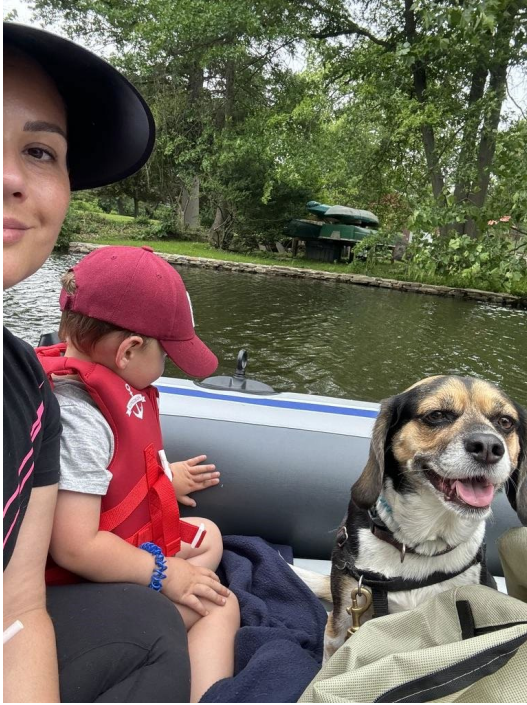
Boating in Mill Pond Park