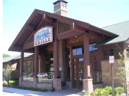
Salt Creek Grille

A review of Table 18 entitled: "Comparison of Largest Employers", notes that total employment with these identified companies and organization totals 7,799 at this time. 2002 and that the Township can expect