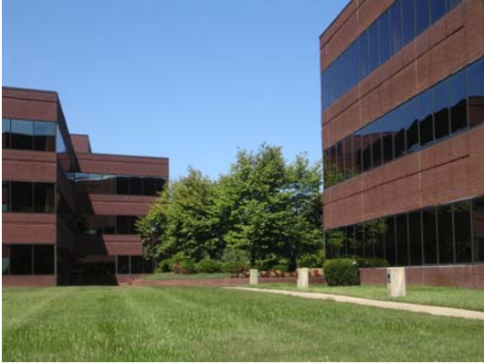
Enterprise Business Park Office

The 47-acre General Business Zone, which is generally located along Scudders Mill Road and Schalks Crossing Road, includes the freestanding Post Office, a freestanding CVS drug store and a 210,000 square foot shopping center which contains a Super Fresh, Ace Hardware store, Pebbles department store and numerous other smaller stores including a McDonalds. The General Business Zone also contains an existing PNC bank building which was recently the subject of a site plan application to the Zoning Board for demolition and replacement. The site plan received Board approval.